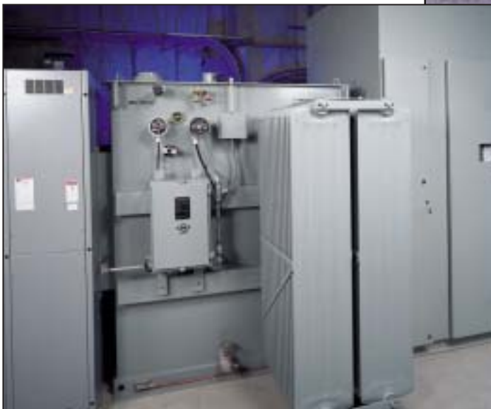
Envirotran transformers will serve Miller Park—Home of the Milwaukee Brewers National League Baseball Team.

When you specify the Code-Listed FM Approved Envirotran transformer, you choose a practical and more dependable solution. Typically, there is no need for a fire vault, automatic sprinklers, or special clearances. The "FM Approved" transformer designs come with a special nameplate listing the transformer's protective devices and other compliance requirements, so the on-site inspector can easily and quickly verify code compliance for both indoor and outdoor installations. For additional information on Code compliance, request the NEC/NESC Requirements Guideline, Cooper Power Systems, Bulletin 92046.