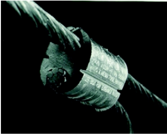
Figure 5. Compression Capability.