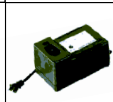
Figure 4. SKBC-68 AC Charger.