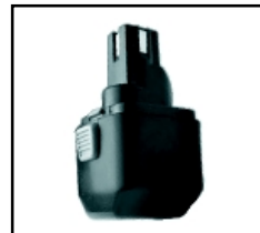
Figure 3. SKB-68 Battery.