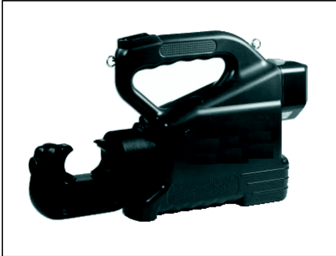
Figure 1. BH-4 - 12 Ton Compression Tool.