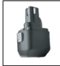
Figure 2. SKB-68 Battery.