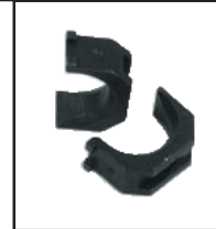
Figure 3. 26994 "D" Dies.