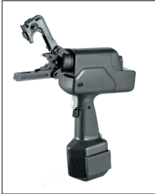
Figure 1. BH-68 - 6 Ton Compression Tool.