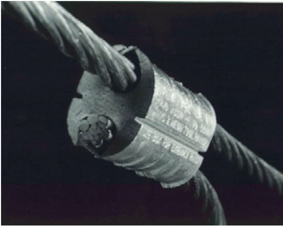
Figure 5. Compression Capability.