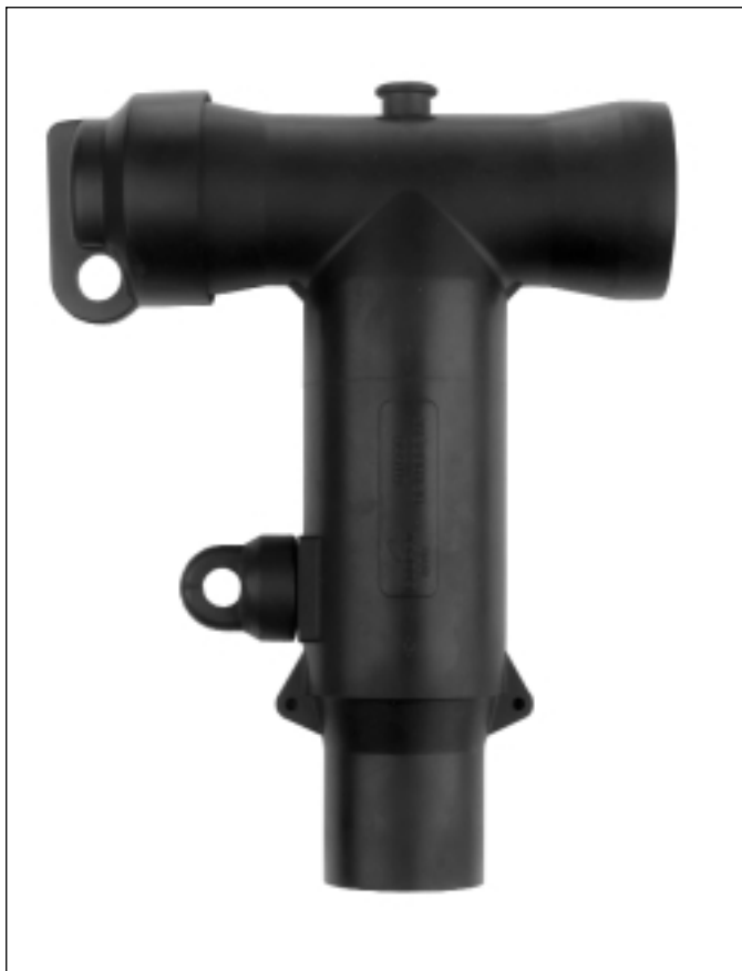
Figure 1. DT608 Deadbreak Tee Connector.