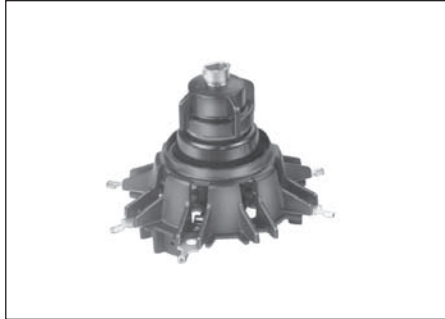
Figure 1. 150 A Externally Operated Series Multiple (Dual Voltage) Switch, with Cap Wrench.

Series multiple (dual voltage) switches are available with cap/wrench, lever, "T", or hotstick-operable handles. The lever handle has an indexing screw to ensure complete, positive switch contact. The cap/wrench handle has an innovative "one-way-in/one-way-out" operating feature that ensures positive operation. The threaded cap protects the shaft seal. The spring-loaded pad lockable handle is hotstick-operable. It allows greater leverage and provides positive indication of switch position.