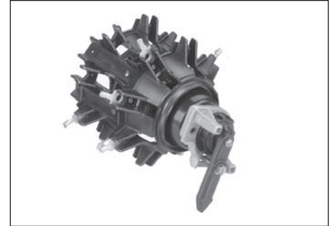
Figure 2. 150 A Externally Operated Series Multiple (Dual Voltage) Switch, with Lever Handle.