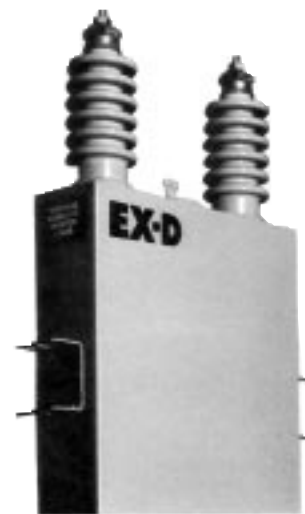
Figure 1. EX®-D single-phase, all-film capacitor.

Capacitor rated voltage is the voltage that can be applied terminal to terminal; for example, a 2400-volt capacitor can be delta-connected on a 2400-volt system or wye-connected on a 2400/ 4160-volt system. In each case, the voltage applied to the capacitor terminals is 2400 volts. Because a capacitor's kVAR output varies as the square of the ratio of applied voltage to rated voltage, application at the proper voltage is essential for optimum operating performance and long service life.