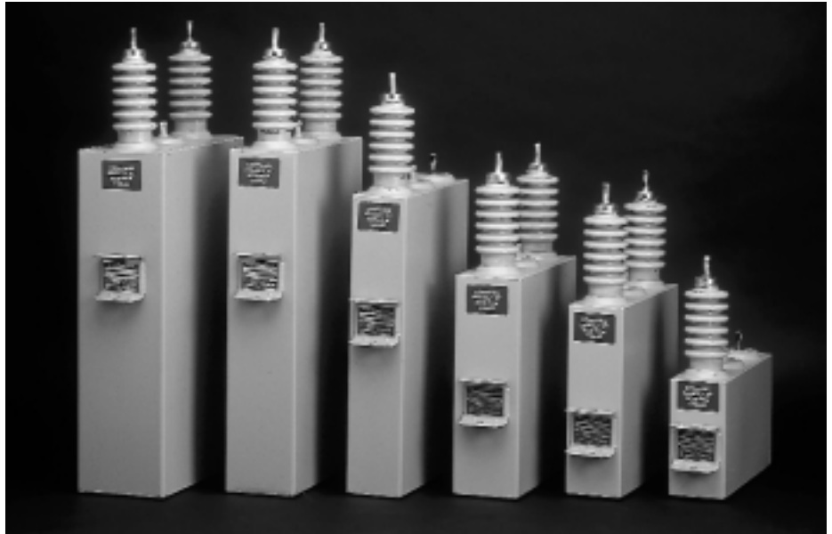
Figure 1. The family of McGraw-Edison single phase, all film capacitors.

Capacitor application requires an evaluation of the power system to determine: