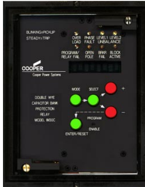
Figure 1. Front View of the IM30C Double Wye Capacitor Bank Relay