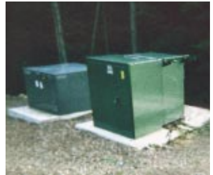
A "traditional" transformer/switchgear combination.

Sure, a transformer and separate switchgear might be the conventional solution to power distribution ... but if you think it's the cost-effective solution, better think again.