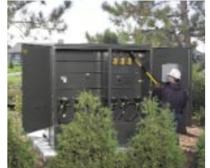
Combining VFI switchgear and a transformer in a single enclosure is more aesthetically pleasing in a residential setting.

Unconventional? Maybe. But that's what innovation is all about.