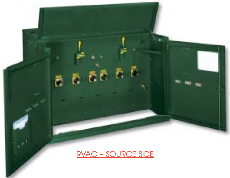
RVAC – SOURCE SIDE

Kyle's Type RVAC padmounted vacuum switchgear is designed for applications including industrial parks and shopping malls where frequent 600-amp main line switching and fuse protection are required. RVAC incorporates vacuum interruption, designed specifically for repetitive switching duty and proven through decades of field usage.